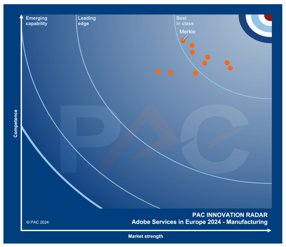
Fig. 1: European Adobe-Related Services PAC INNOVATION RADAR for Manufacturing Capability

Based on the scores in competence and market strength, the overall score is calculated (calculation: competence score plus market strength score, divided by two). From the resulting overall score, each provider receives their characteristic positioning within the PAC RADAR.