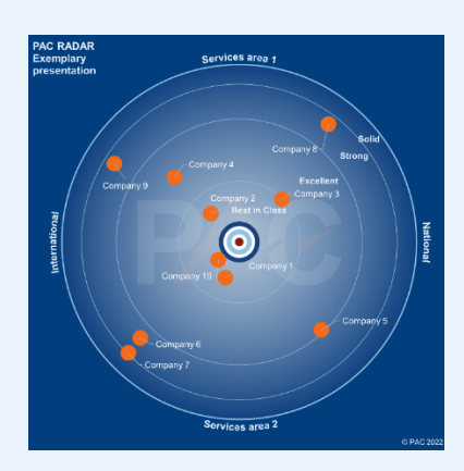
Fig. 1: PAC RADAR graph (exemplary presentation)

The closer a company is to the center, the closer they are to meeting customers' requirements.